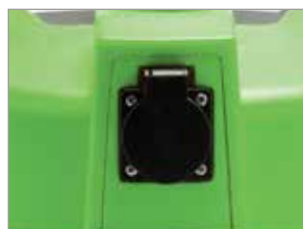
SOCKET FOR POWER TOOL WITH AUTOMATIC START/STOP (TC)