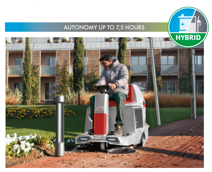
CS60 Hybrid operates up to 7.5 hours non-stop. While the sweeper is powered by the gasoline motor, batteries are recharged, in this way, you can switch from gasoline to battery supply to work in a silent, economic, and ecologic way