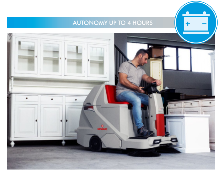
CS60 B is particularly recommended for working in indoor environments, also carpet floors as in hotels and convention centers.