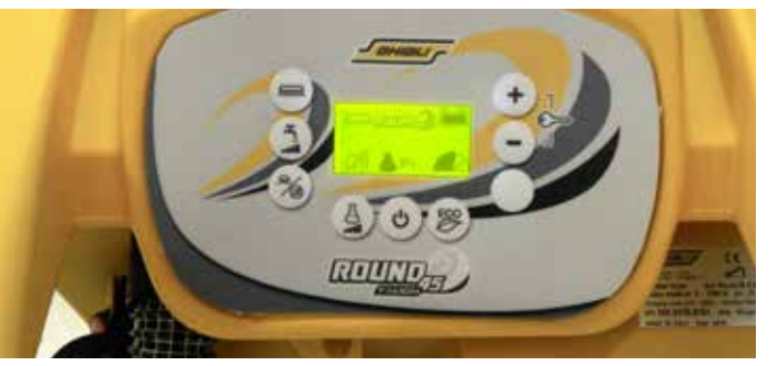
Control panel with display.

And now it is even more innovative and efficient thanks to the TOUCH sensor, and the new ECO SYSTEM for the reduction of energy consuption and respect for the environment.