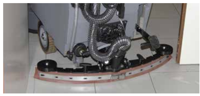
Adjustable and compact squeegee.