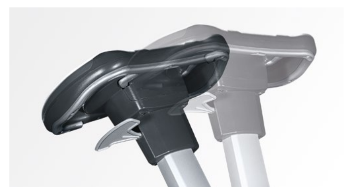
The steering wheel height and tilt are adjustable to suit the stature of the operator and reduce back fatigue

The steering wheel is covered in soft-touch, anti-slip material for a sure, comfortable grip. The controls on the steering wheel are simple and intuitive, and are easy to use for an inexperienced operator, ensuring total control over the machine and the cleaning process. Cleaning settings are already pre-configured when using the automatic scrubbing function. Simply press the AUTO button to start