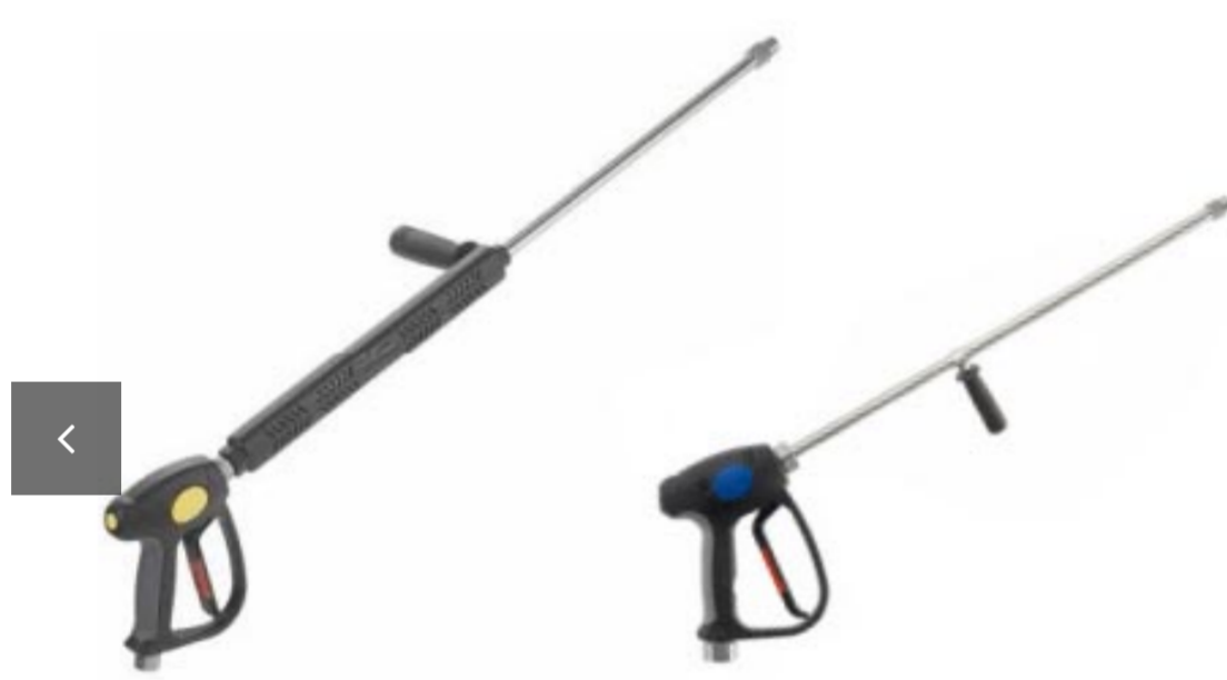
Guns with Lances